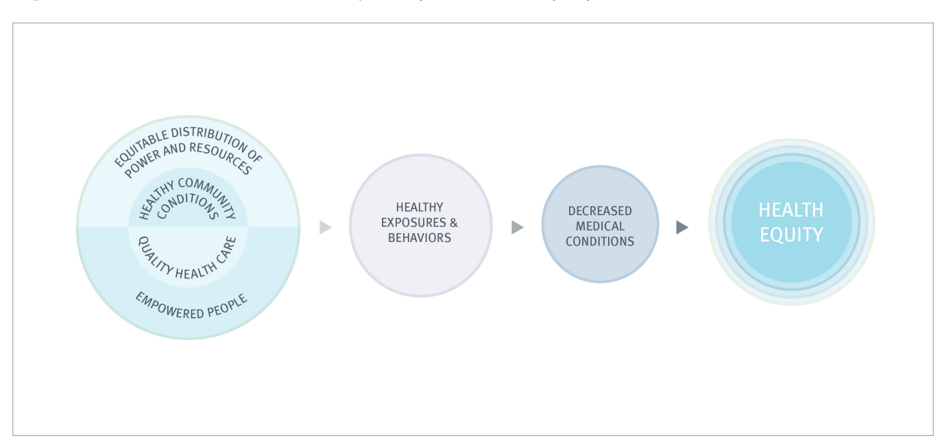
Figure 1. Prevention Institute's Trajectory of Health Equity

The second section of this paper provides an action guide for health equity advocates, identifying shortterm policy options that respond to the current pandemic and longer-term policy recommendations that federal and state policymakers should adopt once the national emergency declaration has been lifted. Following the pathways identified in the Trajectory of Health Equity model above (Figure 1), the policy recommendations target broad drivers of our disturbing COVID-19 outcomes. These recommendations move from "upstream" social drivers of health inequities to the operation of our health care system in the pandemic. Our five recommendations are: