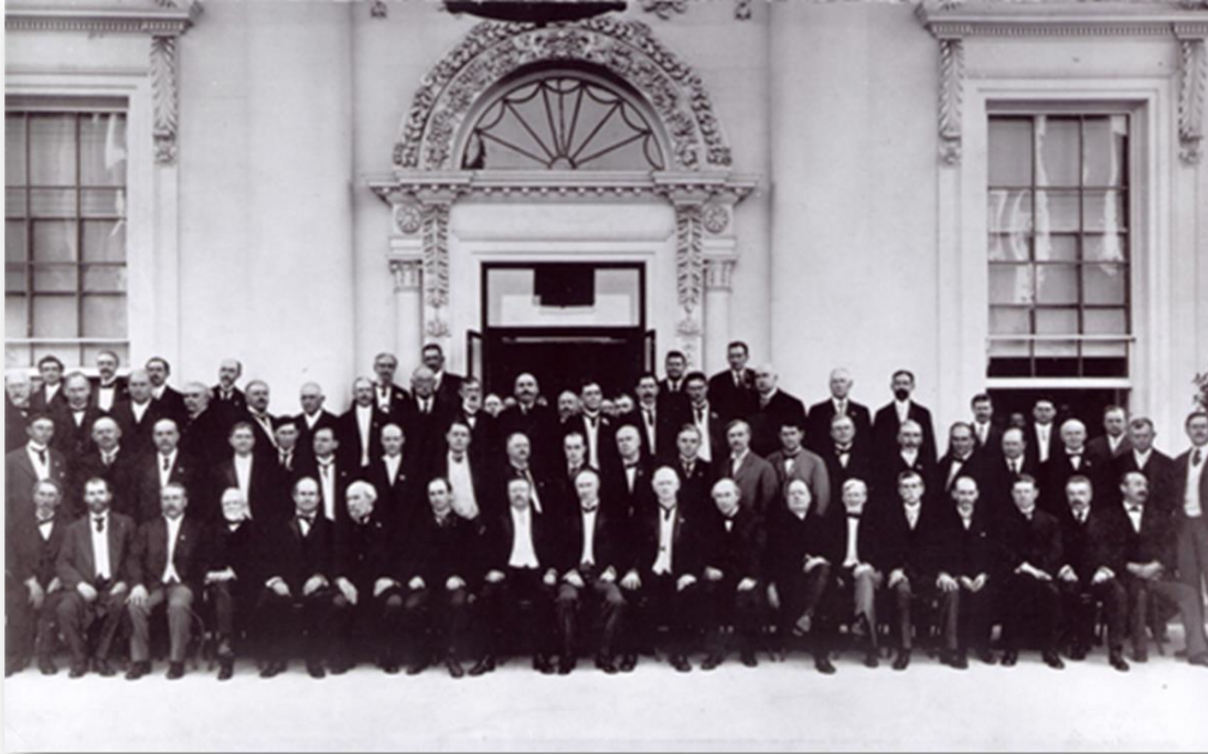
Conference of Governors at the White House, 1908

Over 100 years of serving our nation's governors